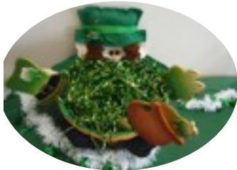
Smiles all around!